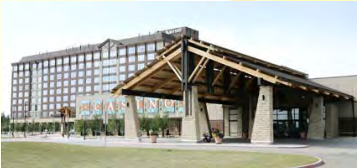
The Marriot River Cree Resort

9 CEC's and 6 CEU's applied for in Professionalism, Health and Safety, Environment, Pest Management and Application Technology.